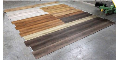
Test specimen installed in laboratory for test.