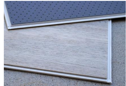
Close up of flooring: top and bottom faces, and edge profile.