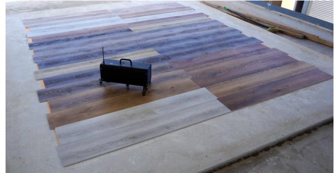
Test specimen installed on the test floor for testing.