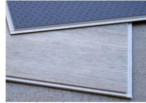
Close up of flooring: top and bottom faces, and edge profile.