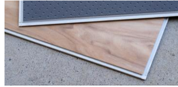
Close up of flooring: top and bottom faces, and edge profile.