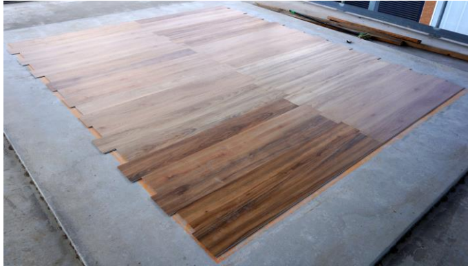
Test specimen installed on the test floor for testing.