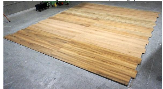
Test specimen installed in laboratory for test.