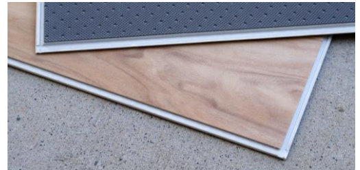
Close up of flooring: top and bottom faces, and edge profile.