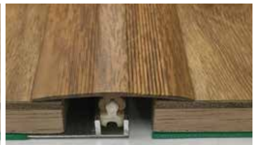
Expansion / Transition