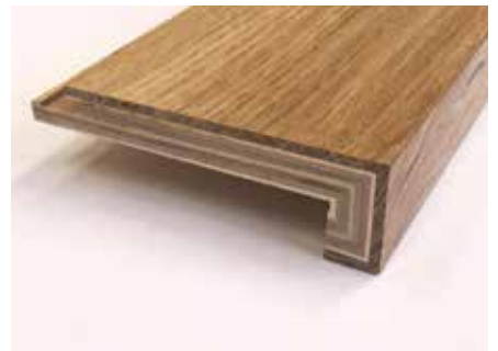
Click Stair Nosing