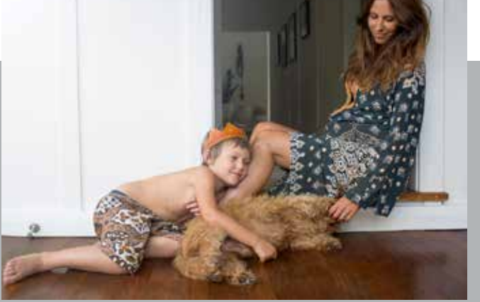
Jacana Spotted Gi