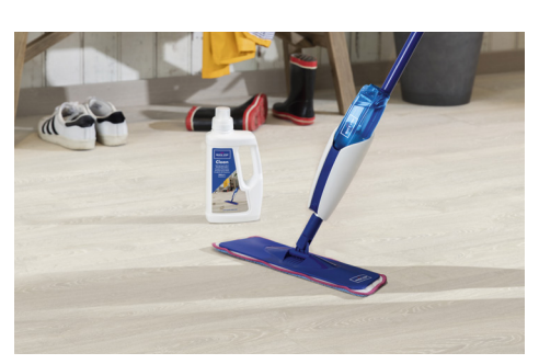
Cleaning kit QSSPRAYKIT A simple way of keeping your floor looking new

Also available separately: Cleaning product 1000ml QSCLEANING1000