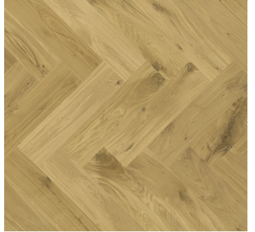
Sierra Herringbone WB05133