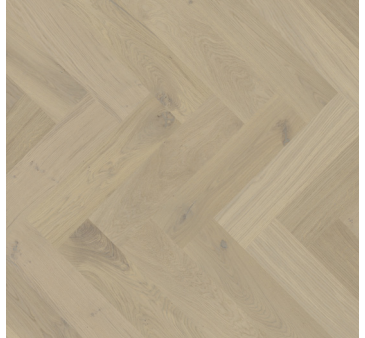
Aspen Grey Herringbone WB05134