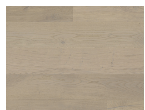
Aspen Grey WB03008