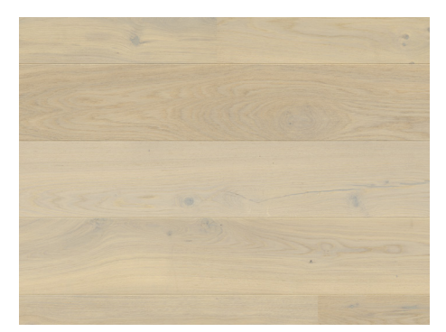
Arctic White WB00008