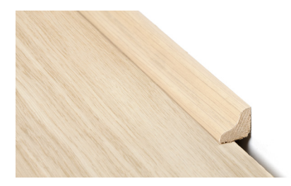
Scotia QFSCOT(-) Closely colour matched trims for a perfect finish. 240 x 1.7 x 1.7cm

Nature's Oak offers a complete solution with closely matching accessories for a beautiful finish of your floor.