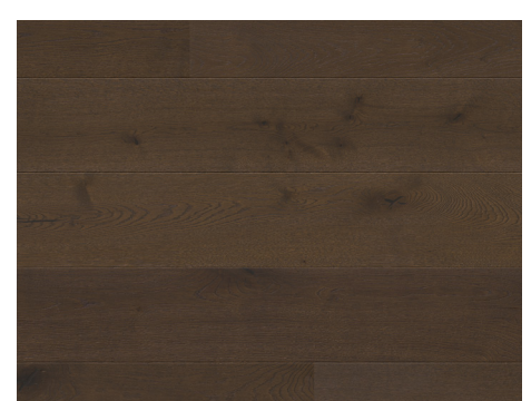
Black Forest WB09008