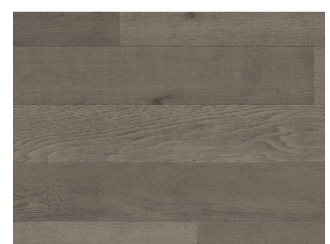
French Grey WB08008