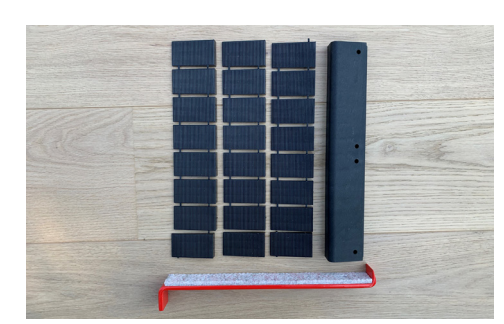
Installation set RFIK Allows easy and professional installation