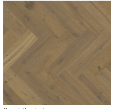
Denali Herringbone WB05132