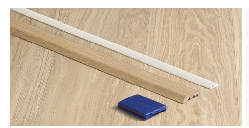
Incizo profile QSWINCP(-) Multi functional finishing accessory 215 x 4.8 x 1.3cm