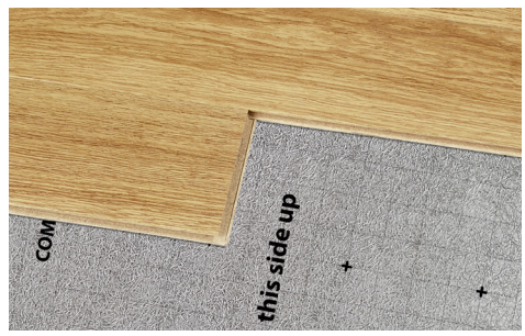
C-LAY(-) | QSC-LAY(-) Standard Combi-Lay for a successful installation. Quiet-Step Combi-lay for the best result and a quieter, more solid floor underfoot.