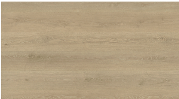
Zebra Ark 941110