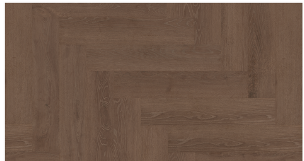
True Tulip 941211