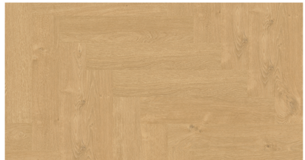
Crown Cone 941209