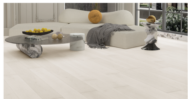
Tiger Lucine 941101

Images are an indication of colour only. Variations in colour & appearance are to be expected between images & samples.