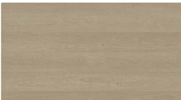
Coffee Bean Trivia 941107