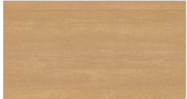
Crown Cone 941109