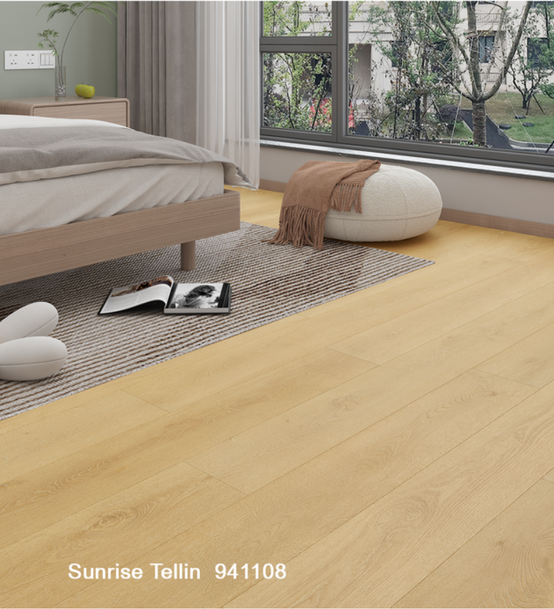
Sunrise Tellin 941108