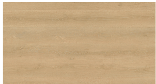
Scotch Bonnet 941106