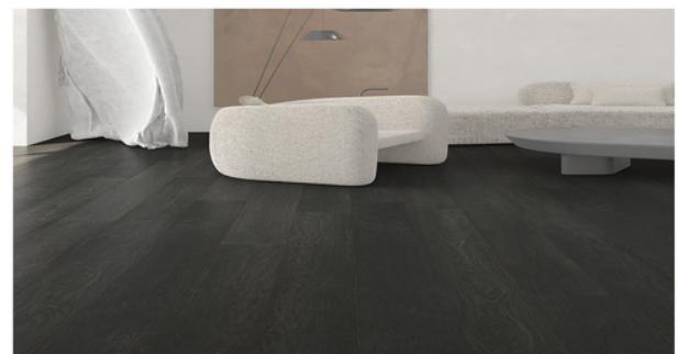
Black Mussel 941112

Images are an indication of colour only. Variations in colour & appearance are to be expected between images & samples.