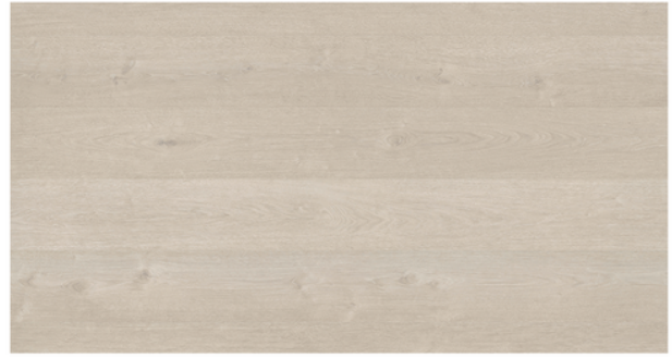
King Helmet 941102