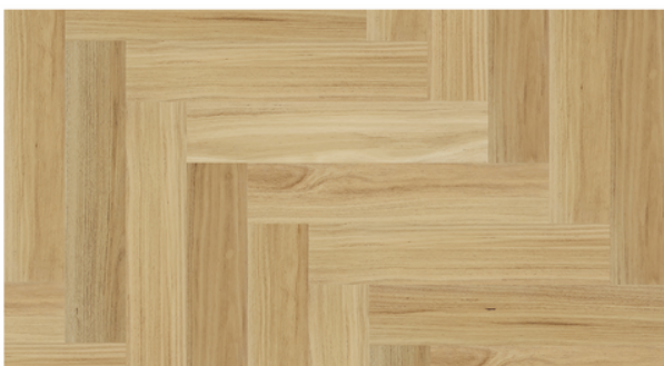
Atlantic Blackbutt 941213