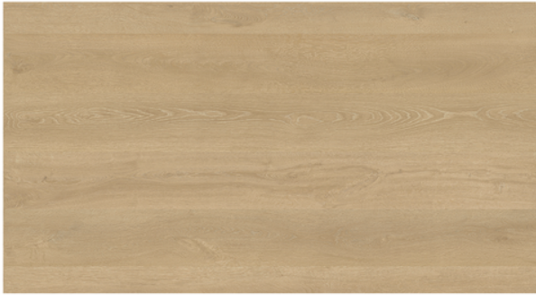
Sunrise Tellin 941108