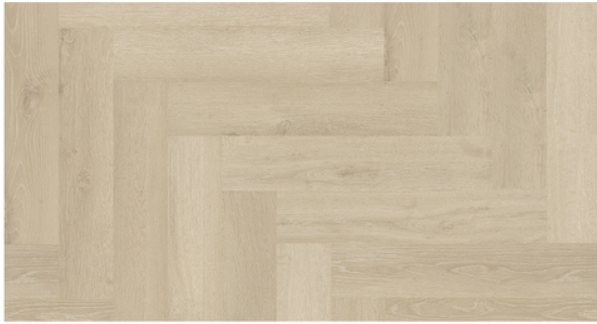
Sand Dollar 941203