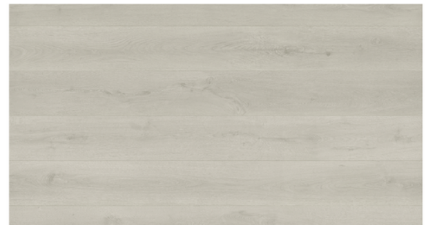
Triton's Trumpet 941104