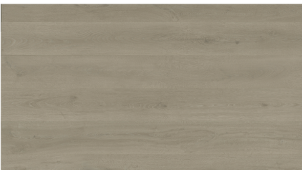
Lettered Olive 941105