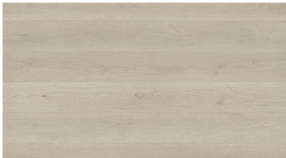
Sand Dollar 941103