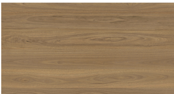
Atlantic Spotted Gum 941114