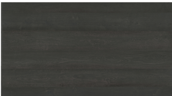
Black Mussel 941112