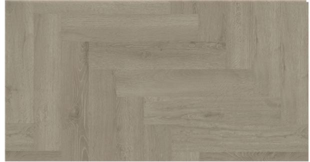
Lettered Olive 941205