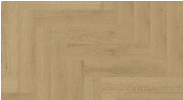
Scotch Bonnet 941206