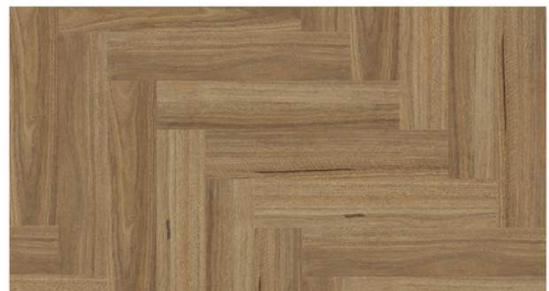
Atlantic Spotted Gum 941214

Images are an indication of colour only. Variations in colour & appearance are to be expected between images & samples.