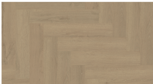
Zebra Ark 941210