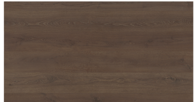
True Tulip 941111