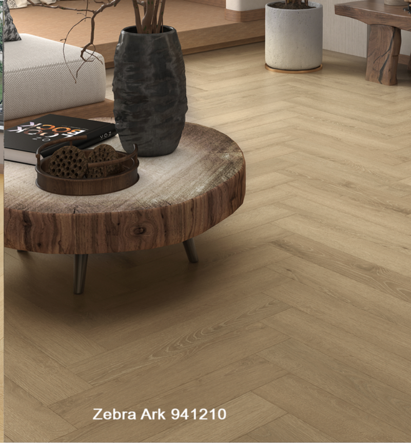
Zebra Ark 941210