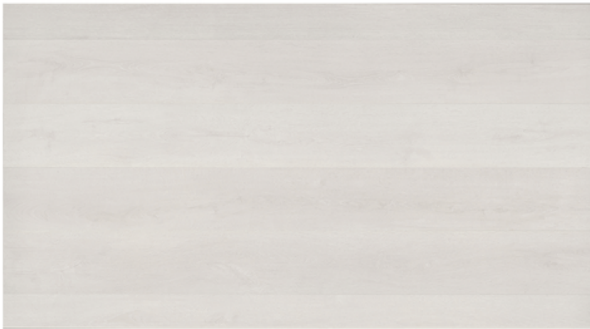
Tiger Lucine 941101