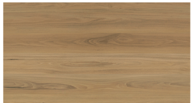
Atlantic Blackbutt 941113