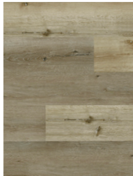
Cappuccino Oak ASH107