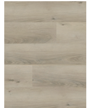
Mist Oak ASH110