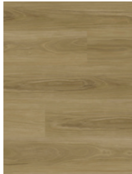
Sandy Blackbutt ASH102