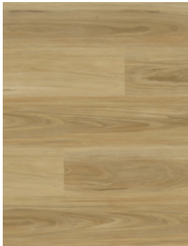
Natural Blackbutt ASH101

Breathe life into your space with stunning natural designs from our Asha Hybrid Flooring collection. With the Oak designs embossed in register, and all decors bringing true-to-life detail and texture to your home, you're sure to find the perfect option to create your own natural oasis. Plus, the range is low maintenance and phthalate free with a 100% waterproof surface, R10 slip rating and Lifetime Domestic Warranty.