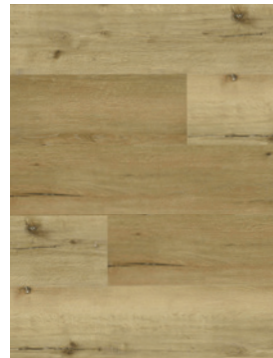
Citrine Oak ASH108