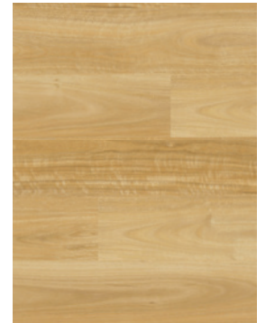
Washed Tasmanian Oak ASH105