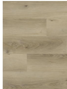
Seachange Oak ASH109