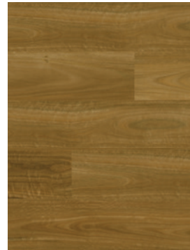
Embered Spotted Gum ASH104