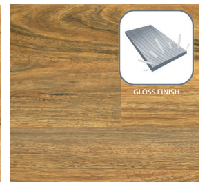
Spotted Gum ESG281

Warranties and Conditions information is available from your retailer, by download from www.imaginefloors.com.au , or by calling (03) 9794 3888. Sample colour image/piece to be used as a guide only and colour variation will vary from board to board. Colour appearance can also vary depending upon type of light under which a sample is viewed and the light source where the flooring is installed.