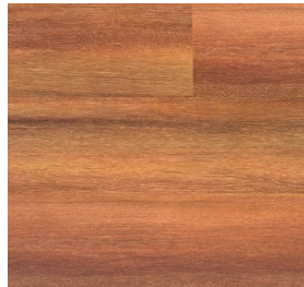
Red Gum ES102