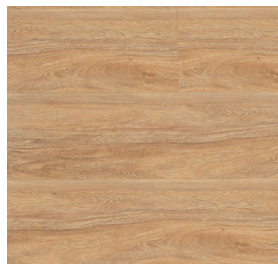
Tasmanian Oak ES108