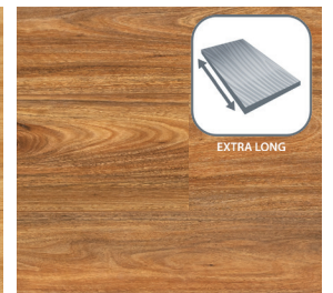
Spotted Gum ES202