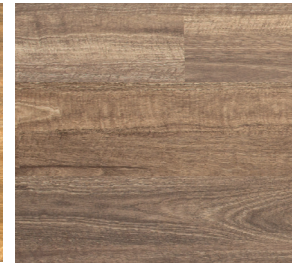
Reclaimed Flooded Gum ES107