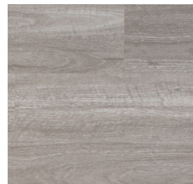
Snow Gum ES109