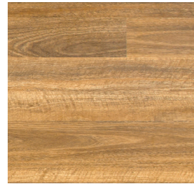
Spotted Gum ES104