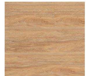
Tasmanian Oak ES108