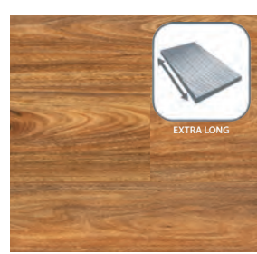
Spotted Gum ES202