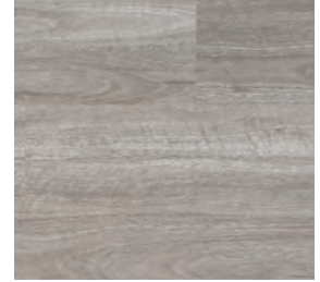
Snow Gum ES109