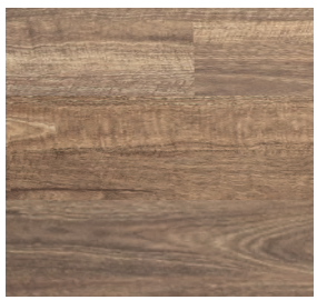
Reclaimed Flooded Gum ES107