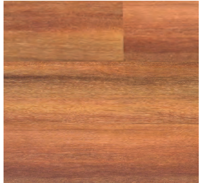
Red Gum ES102

Standard Plank: 1215 x 194 x 8mm Box: 10 planks = 2.3571m<sup>2</sup> Weight per Box: 16.5kg M<sup>2</sup> per Pallet: 141.426m<sup>2</sup>