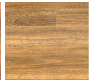
Spotted Gum ES104