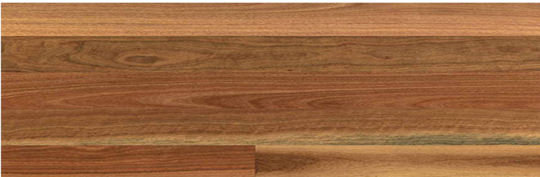
Spotted Gum 882441/2