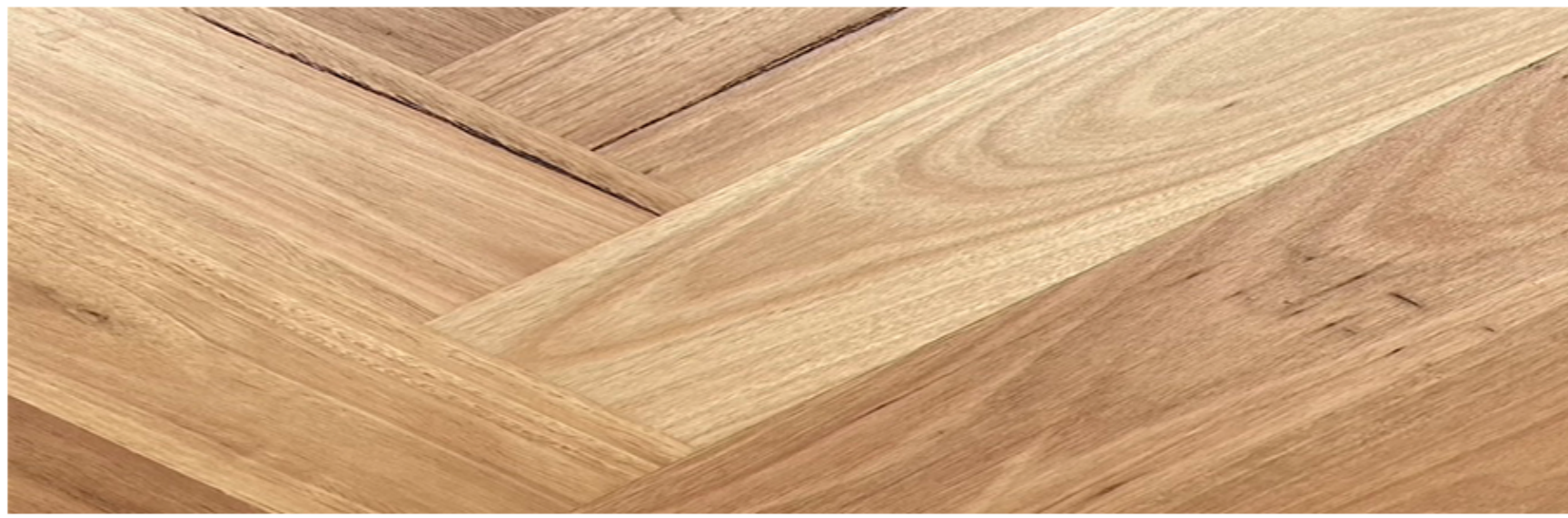
Blackbutt Herringbone 882001/2