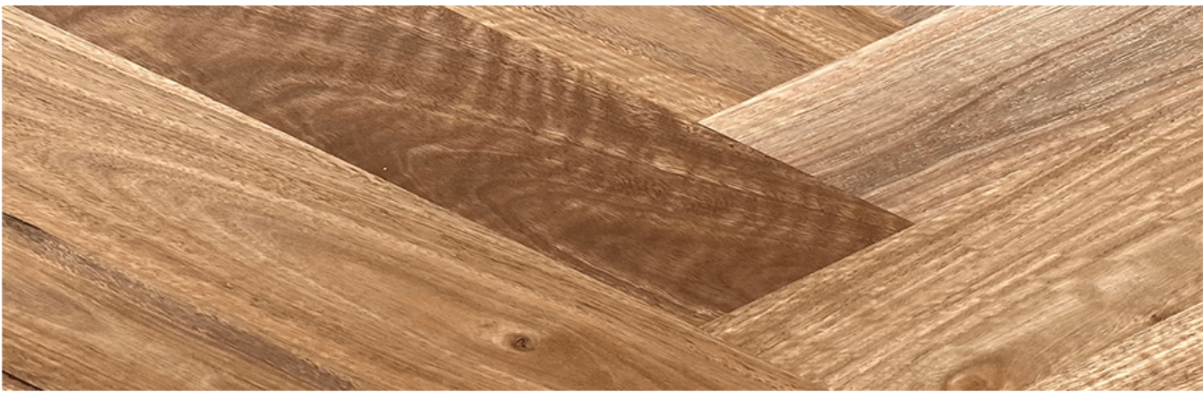
Spotted Gum Herringbone 882002/2